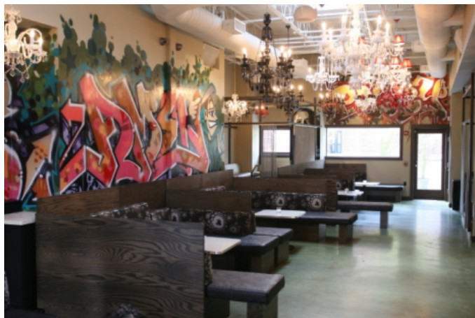
Policy's cool Liberty Lounge is right upstairs!

In fact, calling ahead and letting a restaurant know who you are, and that you hoping to impress a date at their place, is always a good way to find out about unique opportunities and you often get a warm welcome at the door and other special treatment!